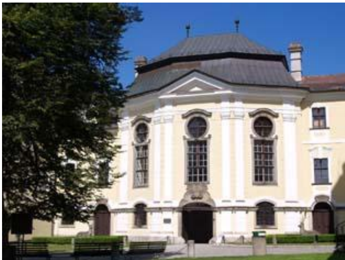
Abbey Church at Žďár nad Sázavou, Confessionals - 2009

The Abbey Church, reconstructed by Santini-Aichel in the 18 th century is a UNESCO World Heritage site. It was returned by the State to the