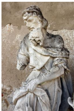
Château of Uherčice Baroque Allegorical Statue of 'Winter' - 2009

In the care of the National Heritage Institute the chateau was derelict in 1996. Our initial grant was made towards the long term restoration to encourage visitors and community activities.