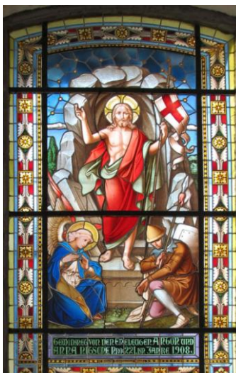
Church of St Nicholas, Petrovice, stained-glass windows - 2014

The church, built in 1793 was roofless and derelict when adopted by the local community in 2004. Our grant towards the restoration of stained-glass windows commemorating the Emperor Franz Joseph was also to encourage further community involvement. The roof was subsequently replaced in 2015.