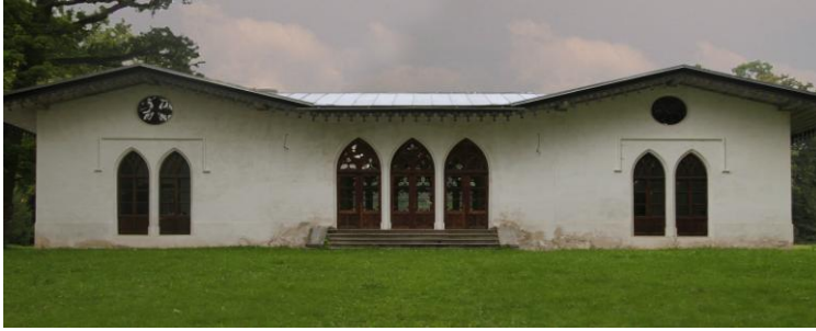
Pheasantry, Château of Červený Dvůr - 2008

The gothic revival building forms an important feature in the park of the psychiatrická léčebna (psychiatric clinic), which occupies the château. We arranged a grant for the conservation of the roof and interior to facilitate its reuse for residential and creative activities.