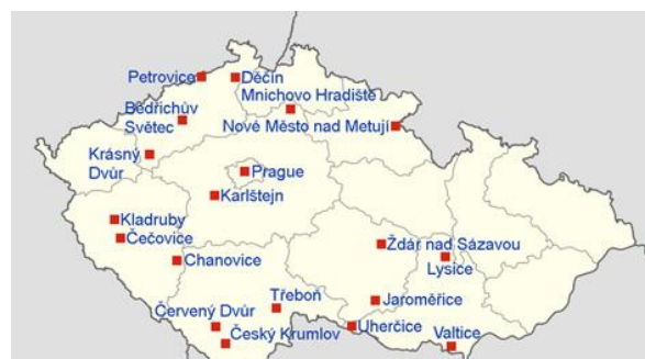
Our conservation projects 2008-2017

Since our foundation, we have sponsored some thirty projects throughout the country, in co-operation with local partners. New projects are under consideration. We have organised 15 working parties of British and Czech volunteers to work on heritage sites in the Czech Republic and have another three planned for 2017. We have contributed over 500 'man days' of volunteer work at the Château of Červený Dvůr alone.