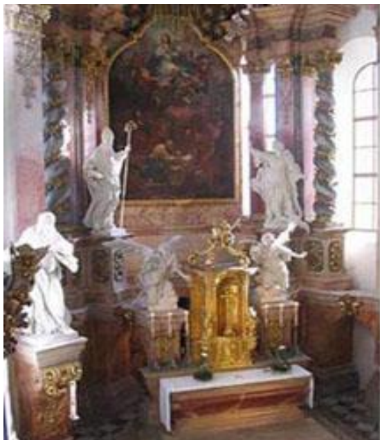
Abbey Church at Žďár nad Sázavou, High Altar - 2010

The 18th-century portrait is one of a number of paintings from the chateau. We intended that our grant should also encourage the conservation of other paintings in the collection.