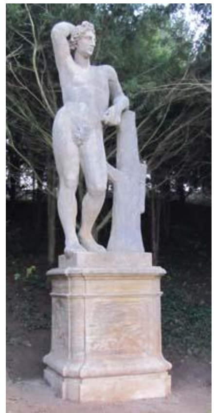
Château of Valtice, Baroque Statue of Apollo - 2013

The church, built in 1793 was roofless and derelict when adopted by the local community in 2004. Our grant towards the restoration of stained-glass windows commemorating the Emperor Franz Joseph was also to encourage further community involvement. The roof was subsequently replaced in 2015.