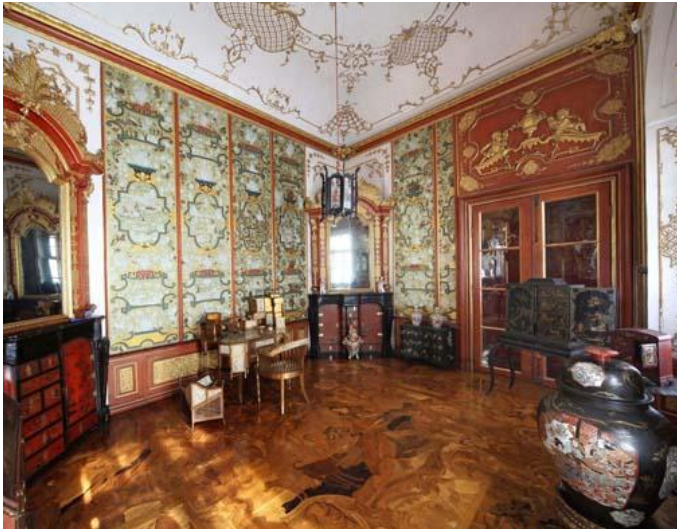
Château of Jaroměřice, Conservation of the Chinese Cabinet - 2015

In the care of the National Heritage Institute, the Chinese Cabinet is unique in the Czech Republic. Our grant will enable the room to be reopened for visitors.