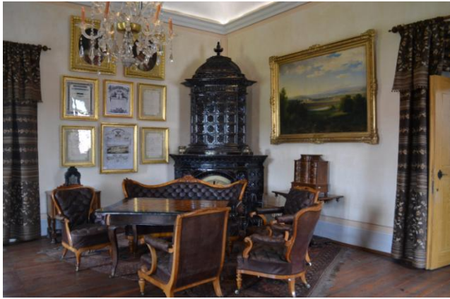
Château of Mnichovo Hradiště, Tiled Stove - 2012

The château, in the care of the National Heritage Institute and open to visitors, was the meeting place in 1833 of the Holy Alliance of European emperors. Our grant assisted the restoration and reopening of the museum dedicated to the event.