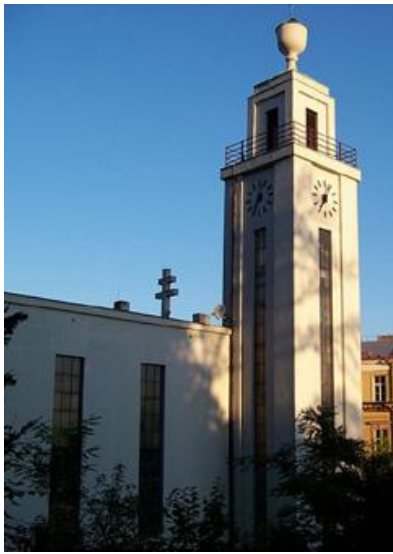
Jan Hus Church, Smíchov, Prague - alterations and conservation - 2016

As part of the continuing restoration of the cottage the attic floor is being reconstructed. We have offered a grant for the work, which is generously supported by a benefactor.