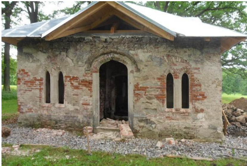
Mauricovna, Château of Červený Dvůr, replacement roof - 2013

Following further work by our volunteers we gave a substantial grant to replace the roof.