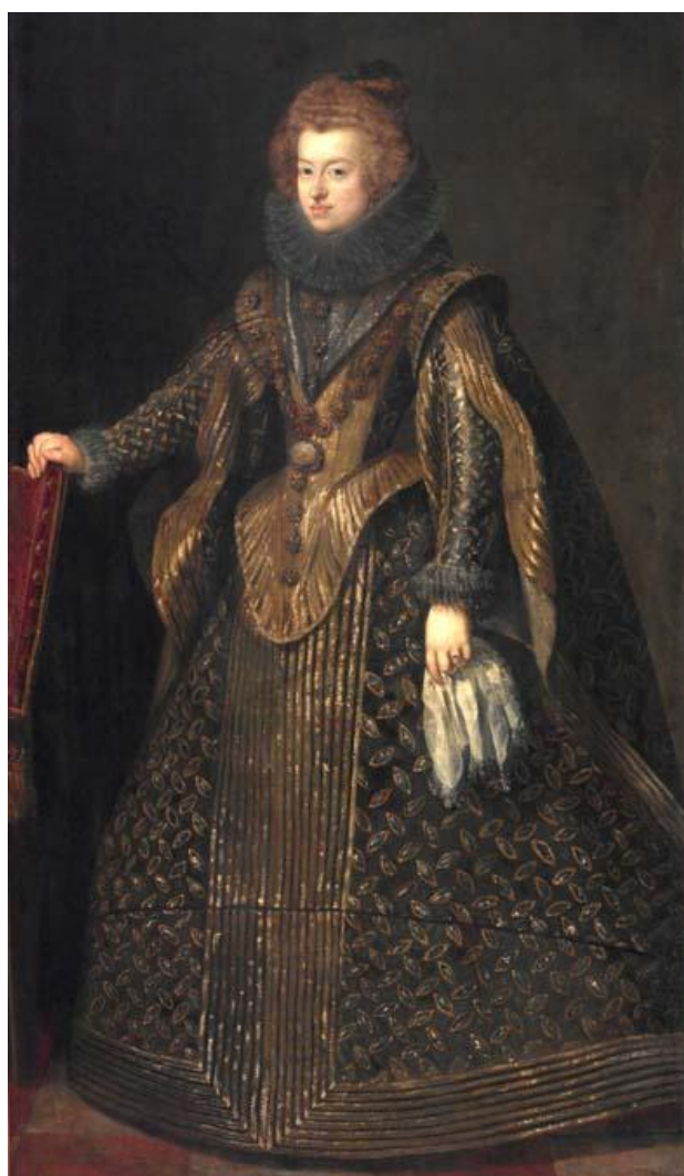
Château of Děčín, Portrait of Princess Maria Anna von Habsburg - 2011

The conservation of the high altar followed upon the previous work to the confessional that we had supported. Our grant for the conservation work is part of our continuing support for the church community.