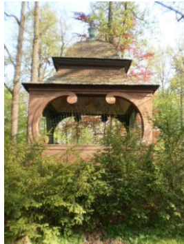
Castle of Český Krumlov, Rococo Garden Arbour - 2009

The gothic revival building forms an important feature in the park of the psychiatrická léčebna (psychiatric clinic), which occupies the château. We arranged a grant for the conservation of the roof and interior to facilitate its reuse for residential and creative activities.