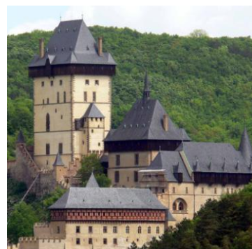
Karlštejn Castle, Conservation of the Gothic Gate - 2014

Of immense historical importance, the castle was built by the Emperor Charles IV. Our grant paid for the conservation of the original gate, which formed the centre-piece of the exhibition at Prague Castle in 2015 of some of the most revered Czech artefacts.