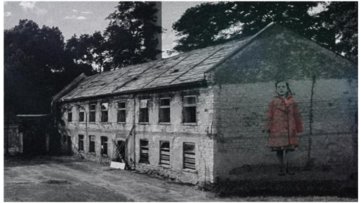
The Löw-Beer factory at Brněnec, the Schindler's Ark